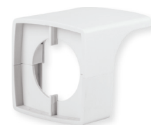
disassembly protection included